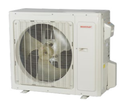
208/230V 18K-48K BTU/h INVERTER-DRIVEN HEAT PUMP SYSTEMS