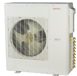
208/230V 18K-42K BTU/h INVERTER-DRIVEN HEAT PUMP SYSTEMS